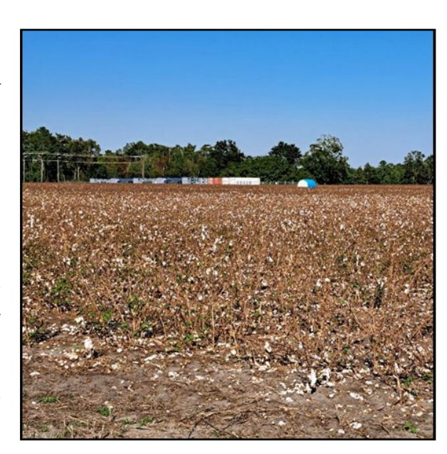
The Park at Satilla will be developed here.

The Douglas-Coffee County Industrial Authority was awarded $500,000 in OneGeorgia funds to construct street, drainage, water, and sewer improvements in its new industrial park, The Park at Satilla. In addition to OneGeorgia Equity Grant funds, the DCCIA has committed $659,991 and the City of Douglas has committed $373,822. The total project cost for the capacity building activities is $1,533,813.